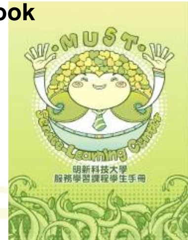
Academic Service-Learning Student Guidebook