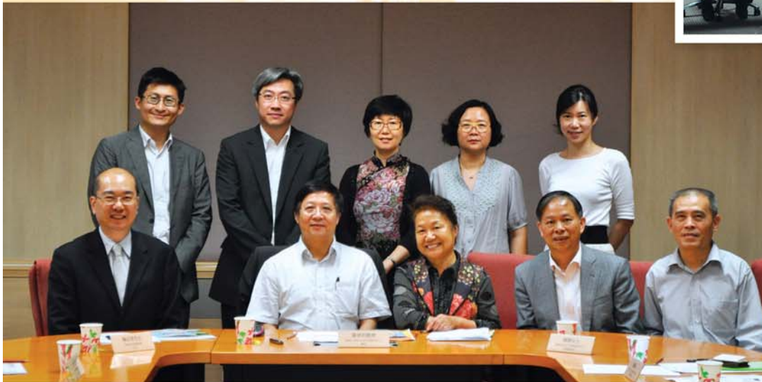
Group photo of the mission with APIAS team.