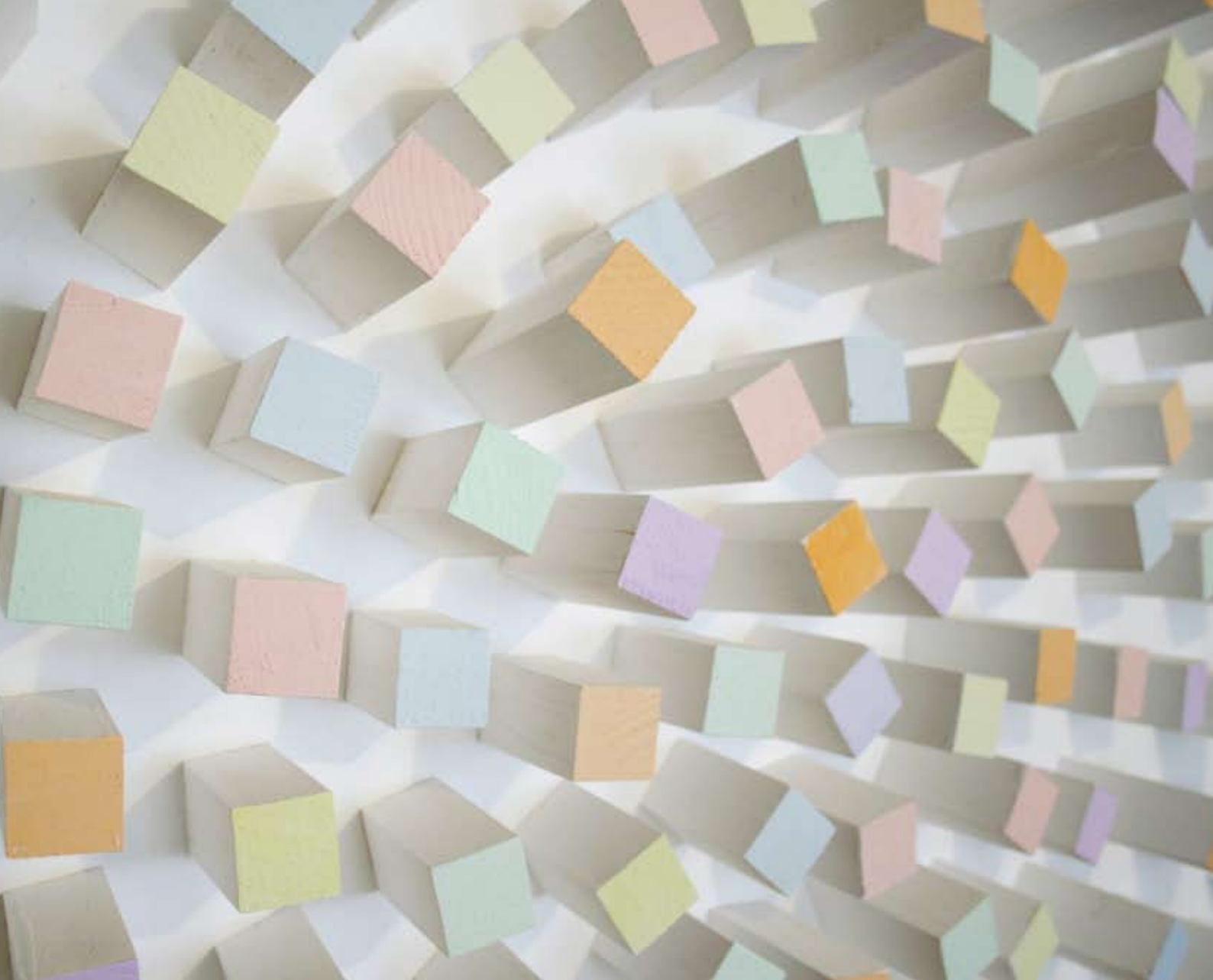
Ring 1 圖(一) 2006