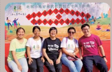
The team paid visits to a partner: Little Donkey Farm in Beijing