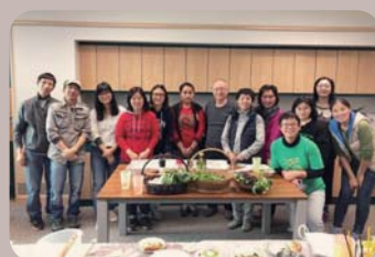
Lunch gatherings to taste food produced from Lingnan Garden or home-made by members