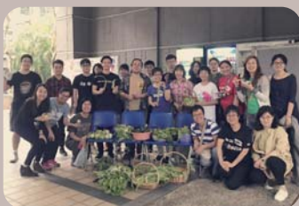
Students work on natural healthy soil and grow over 100 varieties of plants