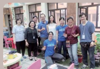
The team helped improve the Mini Garden of Tuen Mun Hospital