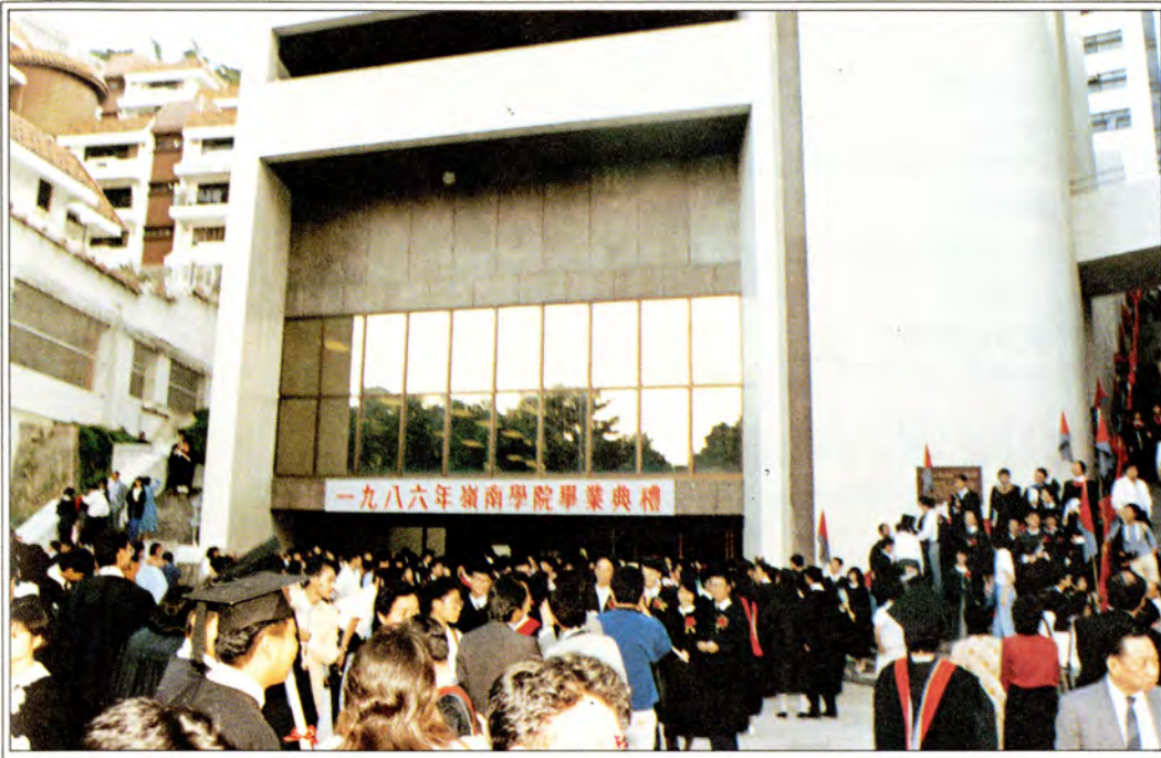
一九八六年畢業典禮盛況 Graduation Day, 1986