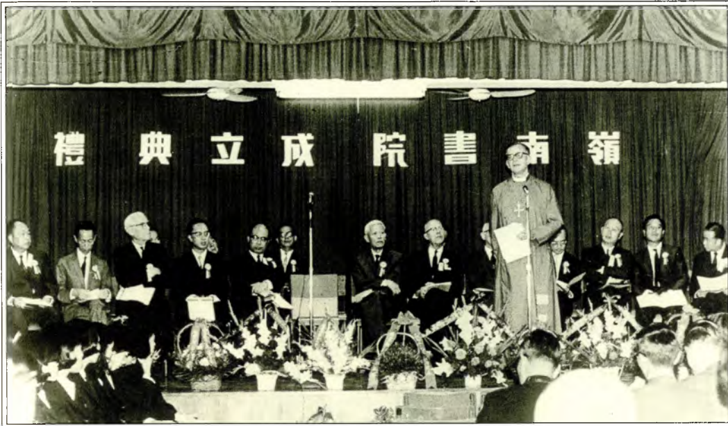
書院成立典禮（一九六七） The Founding Ceremony of the College, 1967