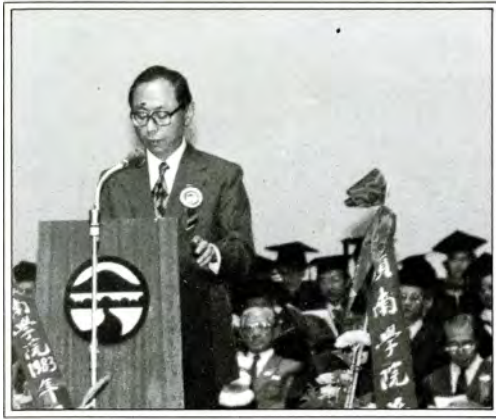
一九八三年畢業典禮主禮嘉賓 楊鐵樑按察司 Mr. Justice Yang, address- ing the 1983 Graduation Ceremony