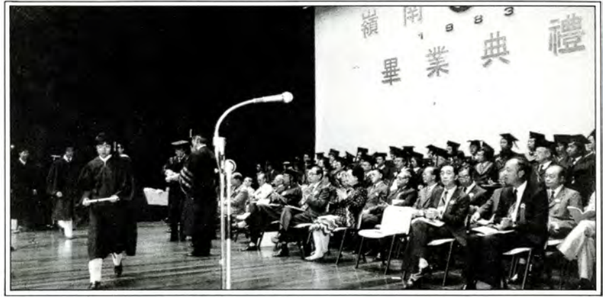
一九八三年畢業禮 Graduation Ceremony, 1983