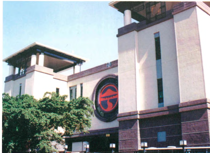
Lingnan College in 1996

Since the 1995-96 academic year, the College has started offering research degree programmes at master's level in Translation and Social Sciences. It is planned to expand these programmes to the discipline areas of Business, Chinese, Humanities and subsequently to offer doctoral programmes in Business, Chinese, Social Sciences and Translation. Student numbers are expected to grow from the present of 2050 to 2100 by 1997-98.