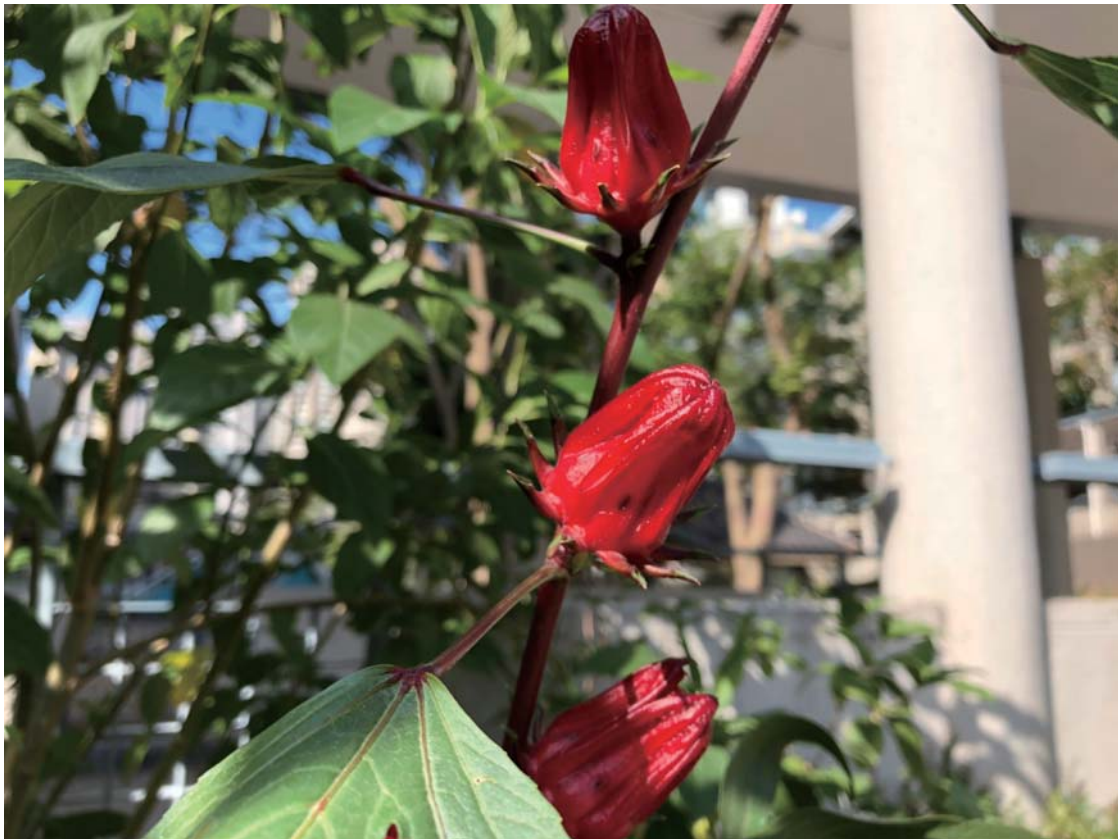
The Roselle at Wing On Plaza

Roselle originates from West Africa and India, and is commonly found in tropical and subtropical regions. It is being cultivated in various places in China, including Guangdong, Guangxi, Fujian, and Yunnan. The flowers are of a beautiful red color, referred to as 'ruby of plants', and have medicinal effects of relieving internal heat, improving complexion, alleviating hangovers, etc. Nevertheless it should be consumed only in small quantity for people with gastric hyperacidity or kidney problems.