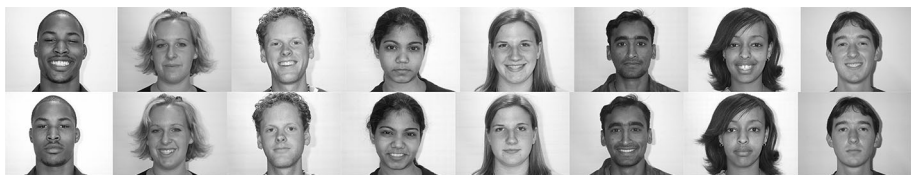
Fig. 1 Photographs used in the current study. Participants assessed either the faces in the upper or those in the lower row

All participants were asked to provide basic demographic information on their gender, age, student status, religion, and father’s highest degree. Individuals were also asked about their ethnicity and nationality in cultures where the team leaders decided that asking about this information was not controversial. The main part of the questionnaire had participants rate eight faces, four smiling and four non-smiling, that were balanced for gender and represented different ethnicities (four European American, two African American, and two Indian, see Fig. 1; the need for ethnic diversity is stressed by Matsumoto and Kudoh 1993) on a 7-point Likert-type scale (1 = trait doesn’t fit at all to 7 = trait fits perfectly ) measuring intelligence (i.e., intelligent, dumb, smart, and stupid ) and honesty (i.e., honest, false, authentic, and unnatural ). Questionnaires in cultures that joined the project later also included five items from Rosenberg’s self-esteem scale (1965), three items from Dunton and Fazio’s motivation to control prejudiced reactions scale (1997), and three additional