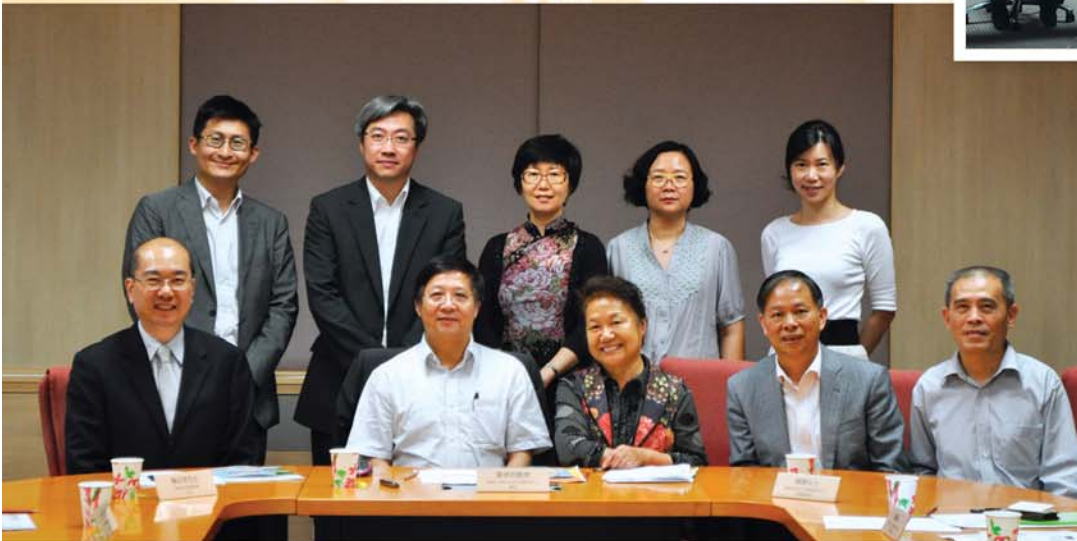
Group photo of the mission with APIAS team.