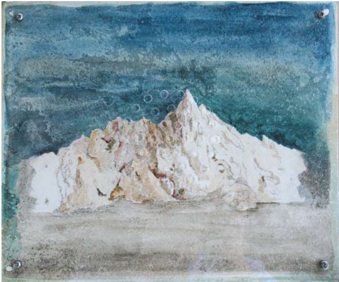
Stereo 音 2006

From our very first day as Visual Studies students, we kept asking “Will we do drawing? Painting? Something practical?” Although we realize we are not going to become artists, there’s still a little hope deep down inside. We want to know more about how artists work, so we can have a more intimate relationship with art. The Artist-in-Residence Programme is a major opportunity and I, for one, am not going to miss out on it!