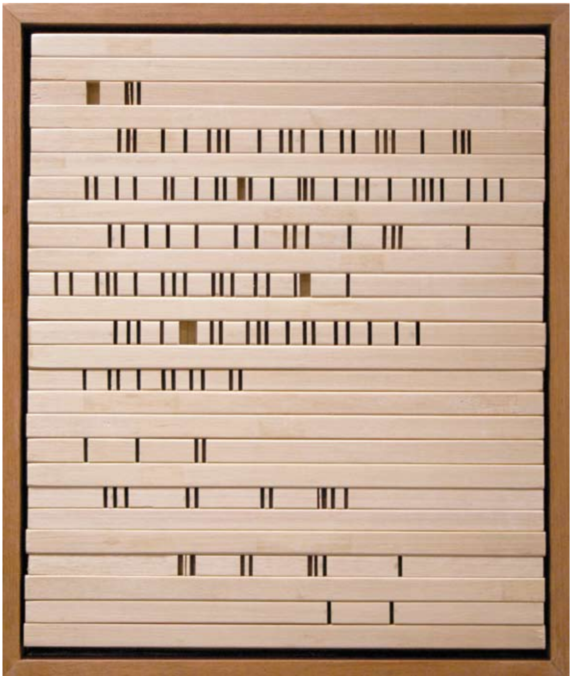
Speech 話語 2005