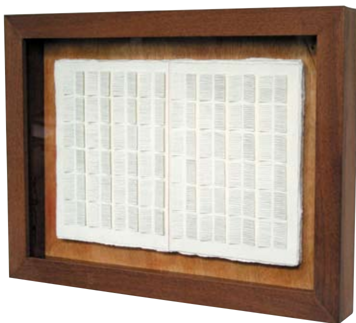
Book 書 2005