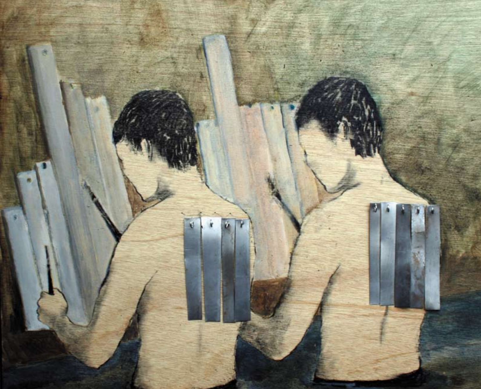
Back 背 2006