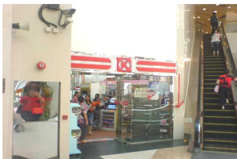
(Convenient store in Fu Tai)