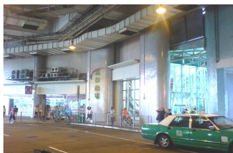
(Fu Tai Shopping arcade)