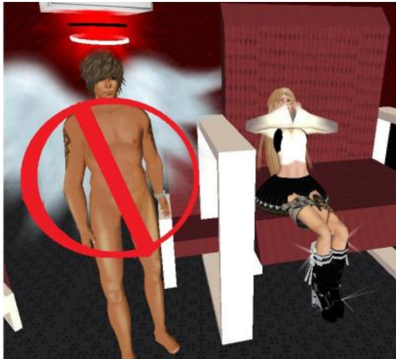
Figure 4. Two students used their SL avatars to create this snapshot illustrating the forbidden behavior of indecent in SL.