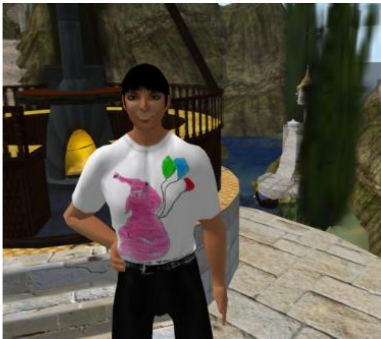
Figure 10. The student displays his design on his representational Second Life avatar.