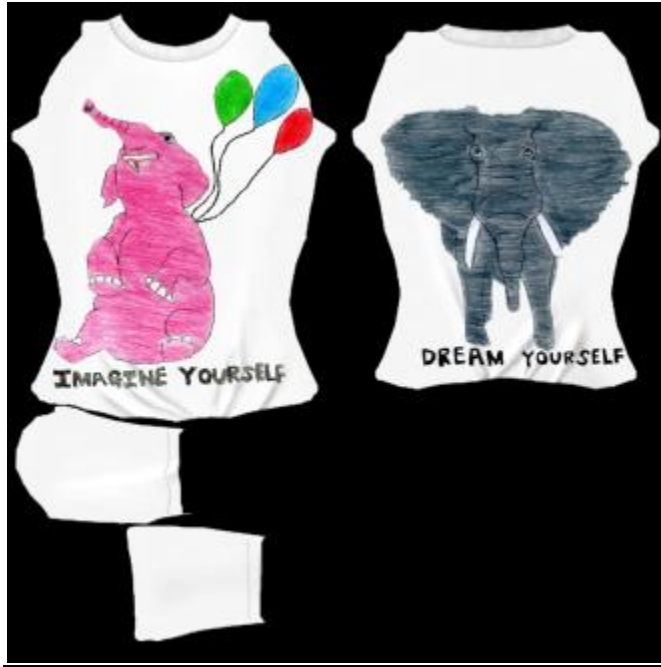
Figure 9. A student T-shirt template with a future-oriented graphic design.