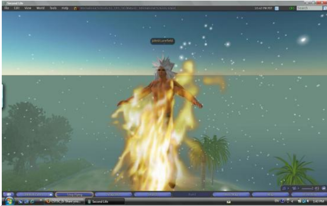
Figure 1. An example snapshot of a representational avatar, posed by the student to indicate a style, or attitude.

representing one's self-attributes in relation to the response they elicit from other people (Higgins, 2005).