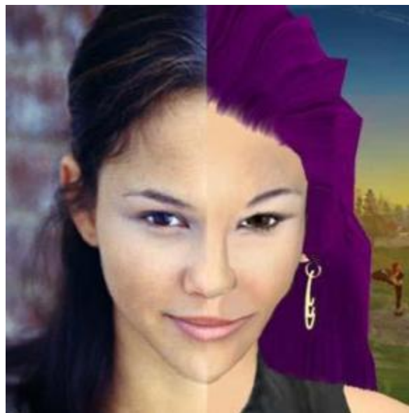
Figure 3. Example of a real face (left half), and its representational SL avatar (right half)