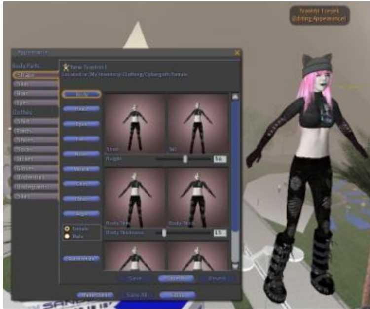
Figure 2. Example of the Second Life avatar appearance modification tools.

Figure 3 for a generic example of the level of accurate facial representation achievable with avatar face design using the Second Life CVE. This activity was designed to help the students continue to acquire instrumental self-knowledge.