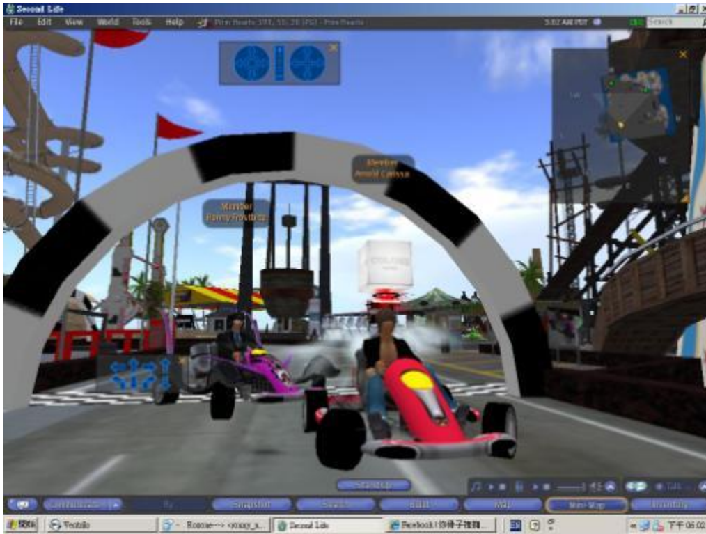
Figure 5. Two students test their relative competencies in racing virtual cars.

were competitive, allowing social comparisons of relative ability which indicate personal skills or talents. See Figure 5 for an example of this activity.