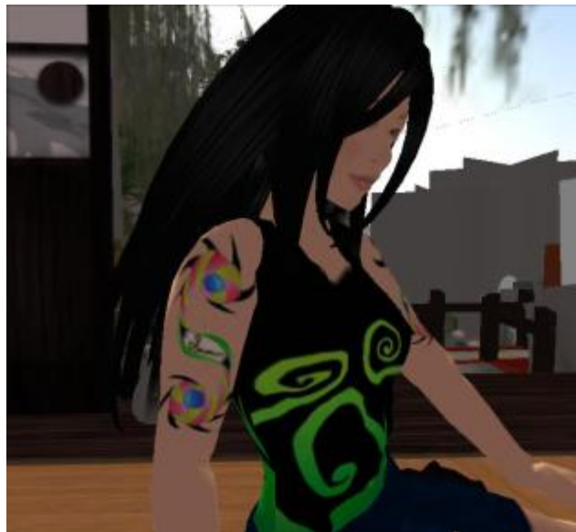
Figure 8. A student displays her colorful tattoo design on a the Second Life avatar which represents a future possible self.

In the second unit of study the students continued to flesh out their conceptualization of a future possible self through the design and implementation of clothing and tattoos for their avatar to wear. As in reality, the development and public display of these style choices evoked considerable feedback from their friends and peers. This further development of a public self congruent with a desired future possible self can be seen in the examples of the girl wearing the colorful and stylish tattoo in Figure 8, and the "Imagine yourself, dream yourself" T-shirt design being developed in Figure 9, and worn in the virtual world in Figure 10. This activity was designed to assist the development and display of self-presentational promotion of a desired self, which according to Schlenker (1996) can change not only their peers' beliefs about them, but also to change their own beliefs about themselves.