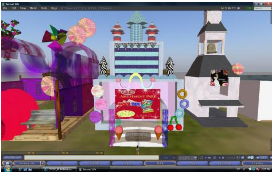
Figure 11. Signs and buildings created by students to host their virtual business designs.

In the final unit the students proposed, designed, developed, and implemented their own businesses in the Second Life virtual world environment. This exploration of possible occupational roles their future selves might play in the world is a key step towards identity achievement (Erikson, 1959; Marcia, 1993). The CVE offers unparalleled opportunities for adolescents to explore a wide range of future possible selves in relation to occupation, which should help them to avoid the less-desirable Foreclosure identity status, and maximize the exploration of possible identities required in the Moratorium status on the path towards successful identity achievement (Marcia, 1993). Figure 11 shows the buildings and advertising signs that students developed as part of this learning activity.