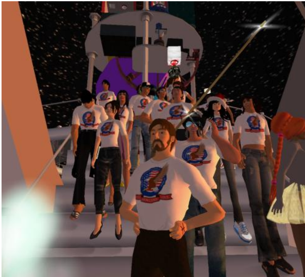
Figure 6. A "group photo" of the experimental group on their CVE field trip.

self representation unique in the group social situation through the wearing of hats, sunglasses, a halo, or in one case a very large orange hairdo. During this activity the students were encouraged to explore the locations in small groups, which facilitates the development of joint attentional collaboration in the service of understanding how the virtual world works, and how to get along in it (Higgins, 2005).